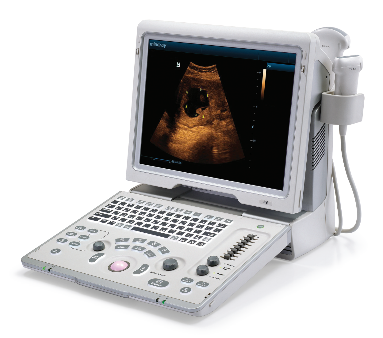
Z6 Digital Ultrasonic Diagnostic Imaging System