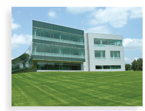
Mindray North America Headquarters Mahwah, NJ

For more information about Mindray products and services, visit www.mindray.com.