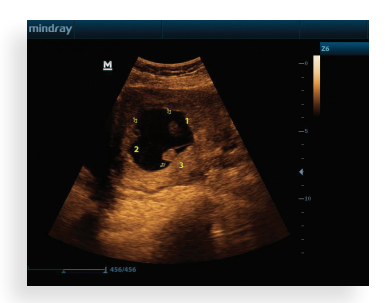
OB imaging - triplets