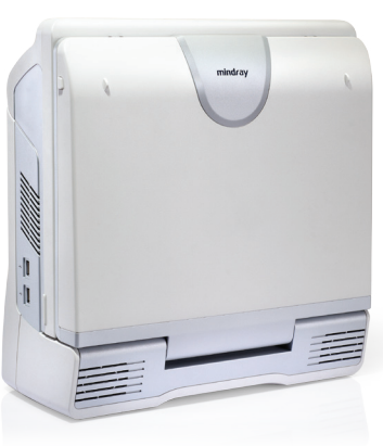
Compact and lightweight for enhanced mobility

With powerful user-defined presets, auto image optimization and patient information management system, Z6 makes it fast and easy to complete exams. Furthermore, Z6 provides onboard reporting and DICOM 3.0 which will greatly improve your workflow without any compromise in diagnosis accuracy.