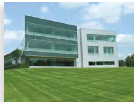
Mindray DS USA, Inc. U.S. headquarters in Mahwah, NJ

Learn how we can help you maximize your resources with some of the most advanced and affordable devices in the industry. For more information about Mindray products and services, visit www.na.mindray.com .