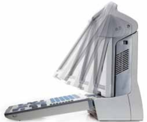
Tilting LCD display allows easy viewing