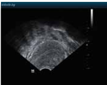
GYN transvaginal imaging

Evaluating patients in today's demanding environment takes innovative technology to speed up diagnosis with greater confidence. Mindray's DP-50 versatility expands your clinical utility while improving patient care.