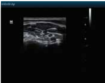
Nerve imaging – pain management