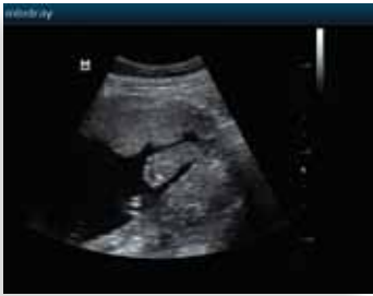
OB imaging – fetal foot

The DP-50 is engineered to help you get the information you need with an innovative high performance compact B/W system. The DP-50's X-treme engine and high speed processing power provides outstanding image quality and a complete information management solution. The insightful design reaches a wide range of clinical applications including abdomen, urology, OB/GYN, small parts, emergency, orthopedics, endocavity, and interventional medicine.