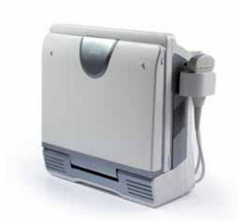
Compact and lightweight for enhanced mobility