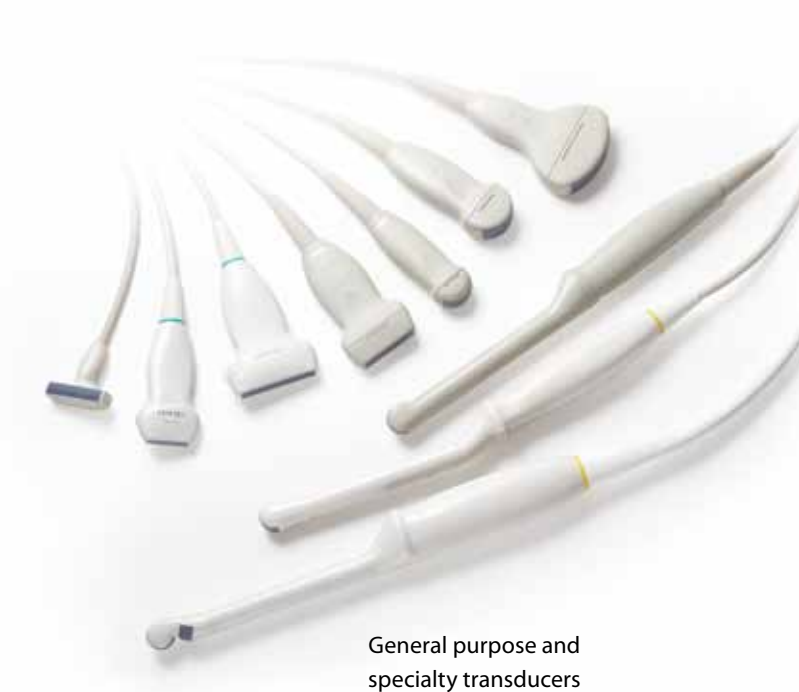
General purpose and specialty transducers