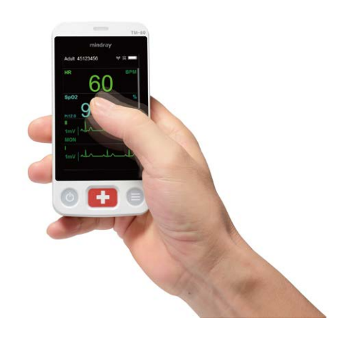
3.5" capacitive screen, operating like a phone, easy to learn.