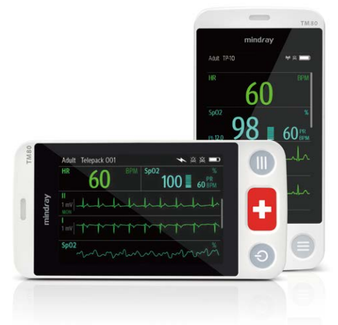
Landscape and portrait display mode, easy to read.

Longer ECG waveforms in landscape display help doctors with QRS complex analysis. Bigger numbers in portrait display help nurses (and even patients) read the values.